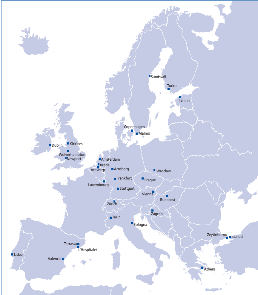
Figure 1: CLIP cities covered in this report