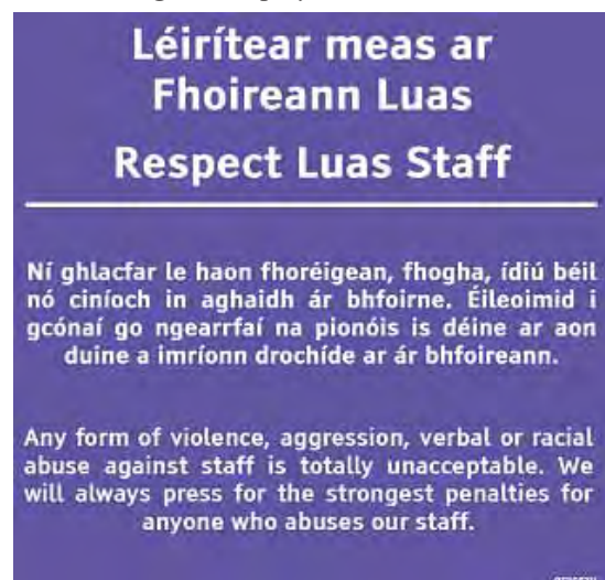
Sign on display on Luas trams

After the publication of the report in October 2011, the Immigrant Council received funding from the Luas, Dublin Bus and Dublin City Council to implement some of the recommendations from the report and to support Dublin Bus and the Luas in playing their part in implementing the recommendations and developing internal mechanisms to deal with the issue. In early 2012, the Immigrant Council, in collaboration with the two companies, organised follow-up focus groups with mixed groups of employees and then met senior officials of the two companies to explore in detail how they should respond to the report.