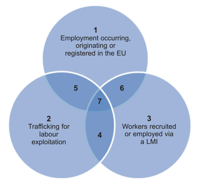
Figure 1: The variety of combinations between employment, recruitment and trafficking for labour exploitation